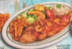
Huachinango A La Diabla With Shrimp

Al Mojo de Ajo Sautéed in garlic sauce A la Diabla SPICY! In hot devil sauce Enchipottada SPICY! In chipotle sauce