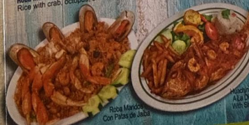
Roba Mariscos Con Palitos de Jicama

Botana Cancún 22 99 Octopus, surimi, shrimp ceviche, calamari w/woodstock sauce & pineapple sauce Langostinos Marinated prawns cooked Nayarit style Sm 28 99 Lg 44 99 Chapulzón Octopus & shrimp in Nayarit style sauce 28 99 Camarones Cuacachas SPICY! 29 99 Deep fried shrimp with spicy red sauce Roba Mariscos Reg 27 99 With crab legs 29 99 Rice with crab, octopus, shrimp, calamari & mussels