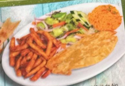
Filete al Mojo de Ajo

Al Mojo de Ajo Sautéed in garlic sauce A la Diabla SPICY! In hot devil sauce Enchipottada SPICY! In chipotle sauce