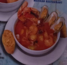
Caldo Siete Mares