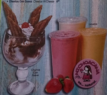
Churros Con Nieve