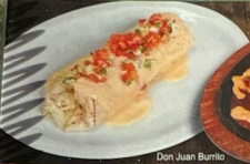
Don Juan Burrito