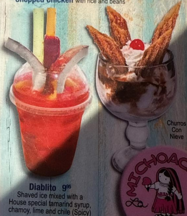
Diabito 9 50

Shaved ice mixed with a House special tamarind syrup, chamoy, lime and chile (Spicy)