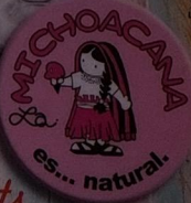
Churros Con Nieve

Shaved ice mixed with a House special tamarind syrup, chamoy, lime and chile (Spicy)