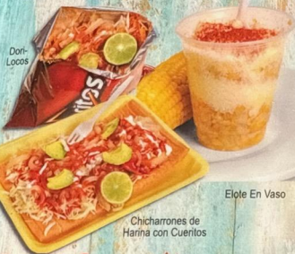
Elote En Vaso