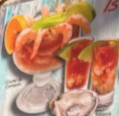
Cocktail de Camaron