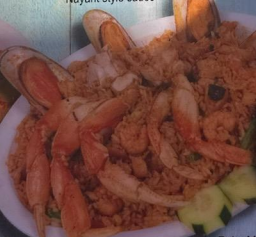
Roba Maridos Con Patas de Jaiba

Bed of rice with carrots, cauliflower, zucchini, broccoli, yellow squash, shrimp and cheese sauce