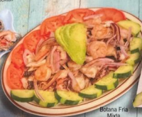
Botana Fria Mixta