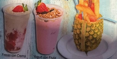
Fresas con Crema